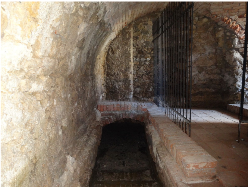
Reconstructed Jewish ritual bath.