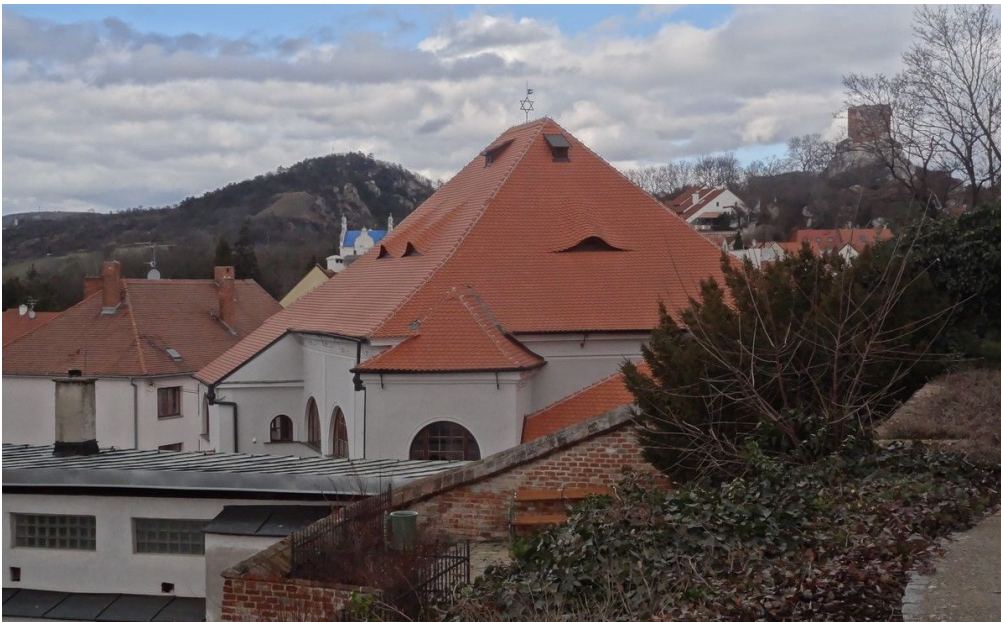
Jewish quarter with the Horní (Upper) Synagogue.